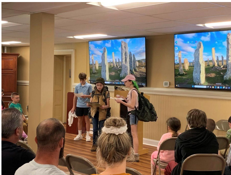
2025 technology upgrades project, supported by a NEPA Synod Witness & Service grant received by Ziegels Union Church