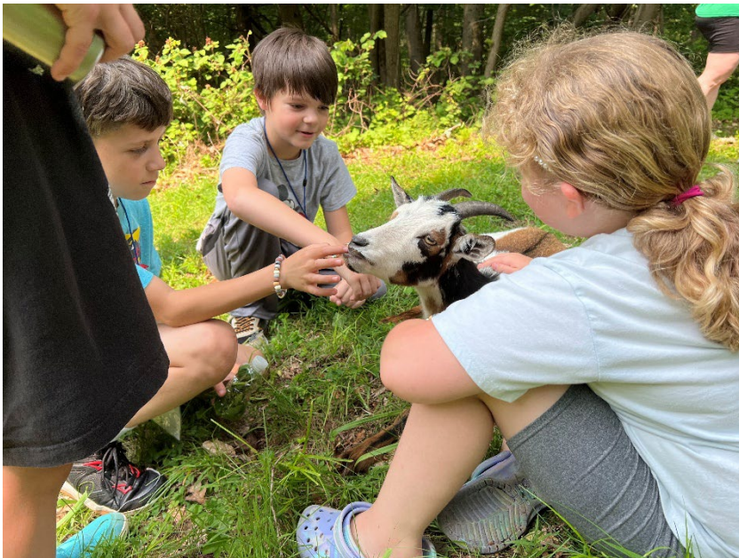
2025 Adventure Camp, supported by a NEPA Synod Witness & Service grant received by participating congregations of the Pretzel City Parish.