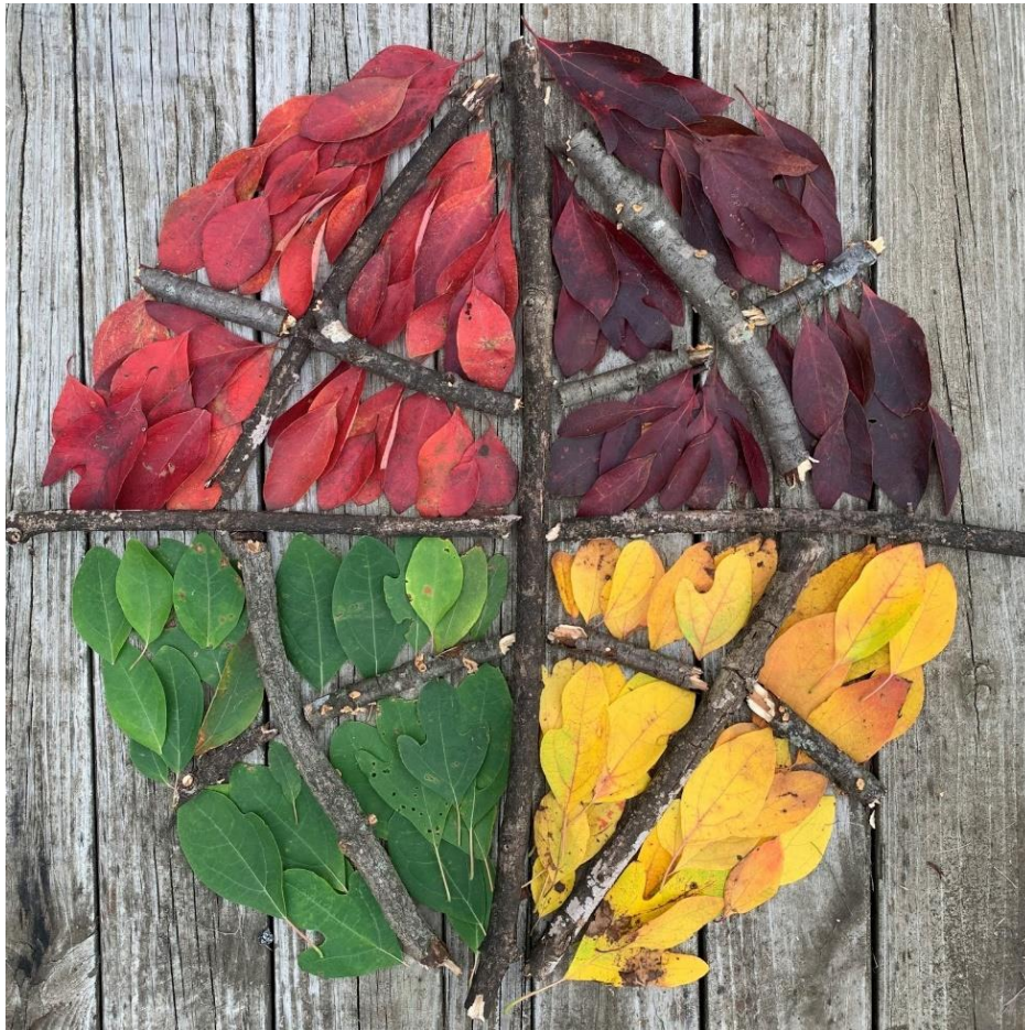
ELCA Logo in sassafras leaves.